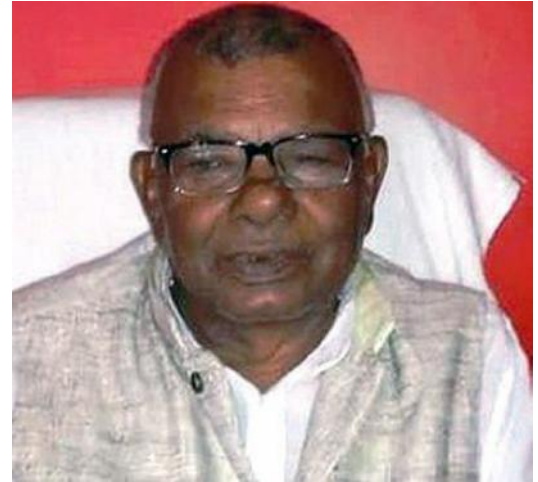
Nawal Kishor Shah Social Development Minister, Province 2

We have fought so much for federalism. We are still struggling for allocation of rights of Singhdarwar equally. Due to the deduction of our demands in the new constitution, we have considered this constitution only partly. We have also burned the constitution by expressing dissatisfaction to this constitution. We have not asked all the sections of the constitution have errors